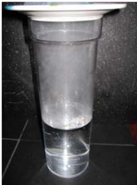
Basic equipment setup

3. Explain to students that they will be investigating the formation of clouds by creating clouds in plastic containers. Model the equipment setup for this activity by placing a tall container half-full of hot water in front of the class. Light a match and drop it into the hot water. Be sure to hold the lit match inside the container for at least 5 seconds before dropping it into the water so that a significant amount of particulate matter accumulates inside the container. Cover the container with a dish of ice, as shown below: